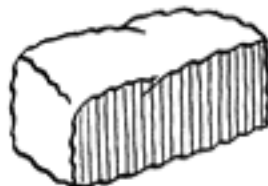
loaf of bread