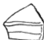
piece of cake